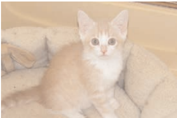
TINY – Growing Up