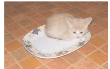
TINY – LITTLE TROUBLE MAKER – always having fun – a true Gem

We will also be in search of an awesome forever home for this dear kitty in a quiet environment with kind, loving folks who will spoil her rotten (perhaps with one of her siblings or her Mom?).