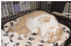
TIGER – RESCUED FROM A HIGH KILL FACILITY - ADOPTED!

Feel free to refer to that story at http://www.pawscanada.org/newsletters/Volume-39-Issue-1.pdf