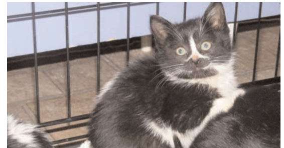
ONE OF THE MANY GORGEOUS BABIES RESCUED BY PAWS IN 2012