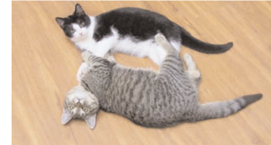
MIA AND SCRAPPIE – Sisters – Still in search of their loving, forever home. These sweet felines continue to call the PAWS Shelter 'home' and are spayed and so hopeful that someone wonderful will step up to adopt them (together?)

PAWS ... 40 YEARS STRONG ~ 40 YEARS DETERMINED ~ 40 YEARS NO-KILL